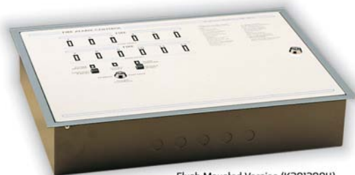
Flush Mounted Version (K3012004)